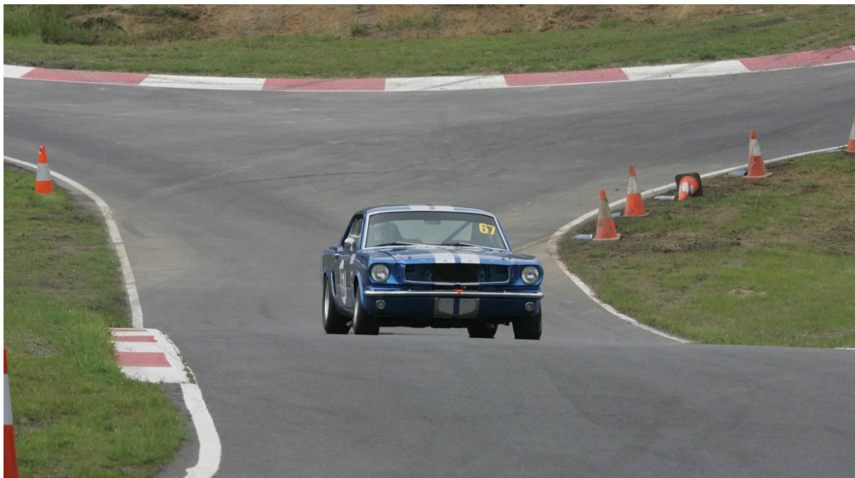
2011 AHCC – Terry Dowel.

INSURANCE REFUNDS You will be aware from writings in the past few editions of Valve Bounce that we suffered significant damage to our Clubrooms, tractor shed and had a long length of fence broken, as well as having a number of items stolen, including a trailer, a Post Office “postie” motorcycle, fire extinguishers and tools. I am very pleased to announce that after a protracted series of negotiations with the insurance company, we received a payout for all of the damage and the stolen items (less our excess) – an excellent outcome. The damage to the Clubrooms has been repaired, with the tractor shed damage to be the next repair on the list. The outcome will be even better when the perpetrator of the crimes appears in court and is directed to pay our excess, if of course that happens.